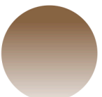
Brown GR 50