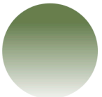
Green GR 25