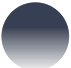
Gray GR 75